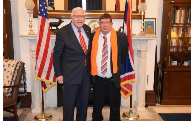
Ambassador Bruce Tippetts (UT) met with Senator Enzi (WY)