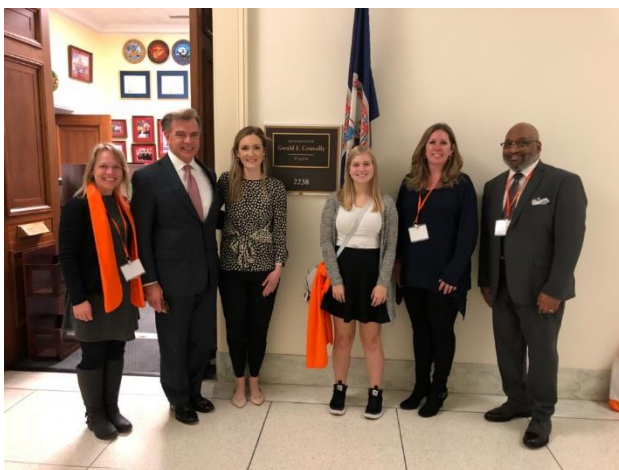
AAKP Ambassadors and BOD visiting with Representative Connolly's (VA) staff