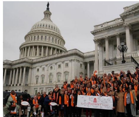
The 2018 Kidney Patient Summit group photo