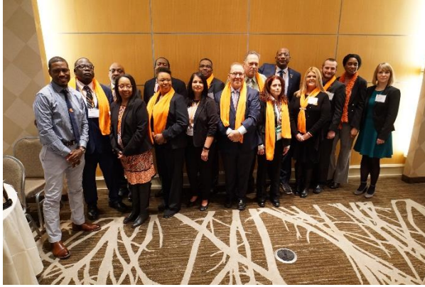
AAKP Ambassadors at the Summit